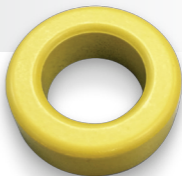
Minelab Accessory Ferrite (Part No. 3011-0301)

To achieve optimum ground balance, the GPZ 7000 requires as much different data about the ground as possible, especially variations in the soil mineralisation.